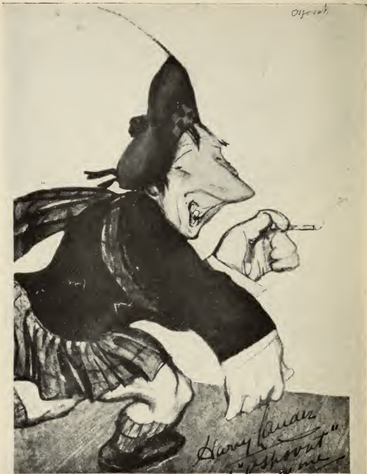
BY HENRY OSPOVAT